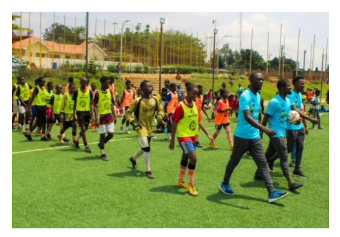
Coaching Boys into Men is global, reaching boys and young people across the United States and in countries across Africa, Australia, and India.

Our STAGES (Strategies to Advance Greater Elder Safety) work, which is identifying innovative ways to prevent and address elder abuse beyond the traditional legal system, will soon announce the eight community-based organizations that will lead new projects to support the economic wellbeing or healing of older adults who have been abused. We will work intensively with these organizations for the next two years to learn together about the dynamics of abuse against seniors, opportunities to build resilience, and ways to create pathways for health and healing. We will disseminate the learnings and strategies from this groundbreaking work widely and to diverse audiences to build a powerful community working to protect older adults.