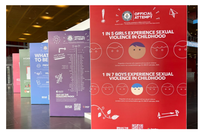
FUTURES has stepped up its advocacy to end violence against children globally, which affects 1 billion girls and boys.

Violence against women knows no borders. One out of every three women worldwide will be physically, sexually or otherwise abused during her lifetime with rates reaching 70 percent in some countries. FUTURES co-chairs the Coalition to End Violence Gender-Based Globally , a network of more than 150 US-based organizations, which together helped secure $75 million in U.S. funding to address violence against children globally and $650 million to address violence against women, gender equality, and women's empowerment.