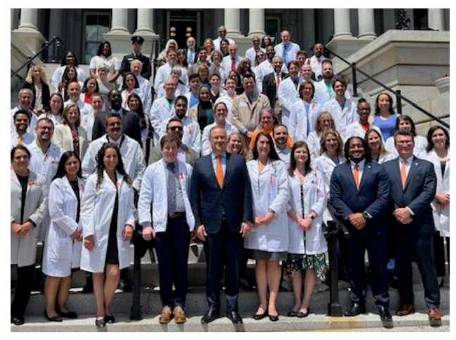
We've transformed America's health care system, training generations of doctors, nurses and other health care providers to support people facing family violence.

Safety. It's the prerequisite to good health, the essential foundation for any society in which children succeed, families thrive, and communities flourish and prosper. But safety is far from a given for everyone in our world today. It's a goal, an aspiration, and here at Futures Without Violence, enhancing safety is the work we do every day. Whether it's preventing and responding to domestic violence, helping children exposed to violence recover from trauma, or ensuring abusers do not have access to guns, it will take all of us to make our nation safe for us all – and we're at the forefront, developing dynamic new strategies and making progress on many fronts.