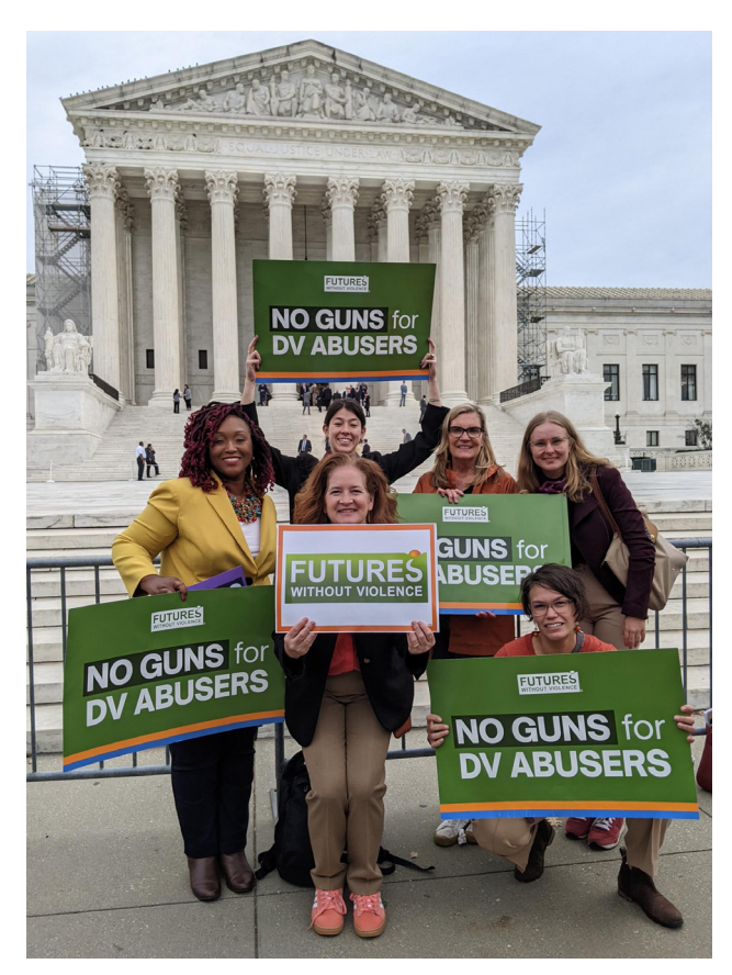
FUTURES amplified the need to prevent abusers from accessing guns during the United States v. Rahimi Supreme Court case.

Finally, nobody can be safe when abusers have access to guns, so we did intensive work this year around United States v. Rahimi , the U.S. Supreme Court case that threatened the common-sense safety measure of denying firearms to people with domestic violence protective orders. Our powerful advocacy and public education work emphasized