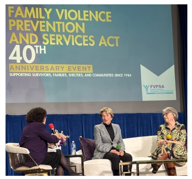
FUTURES was a driving force behind the Violence Against Women Act and the Family Violence Prevention and Services Act, which fund lifesaving programs and services.

This year, the Violence Against Women Act (VAWA) turned 30 and the Family Violence Prevention and Services Act (FVPSA) turned 40. Together, these laws provided funds for urgently needed services, including the nation's network of domestic violence shelters, expanded community and legal responses, and brought domestic violence out of the shadows. As a result, domestic violence against adult women has decreased by over 60 percent since these laws were enacted.