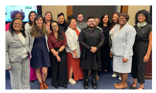
This year, our Survivor Leadership Cohort shared their experiences accessing healthcare at a Congressional briefing, part of our commitment to center the voices and experiences of survivors in our work.

This year our National Judicial Institute on Domestic Violence , created in partnership with the National Council of Juvenile and Family Court Judges, is celebrating 25 years of extraordinary work. During that time, we've brought training and continuing education to more than 10,000 judges and judicial officers, educating them on the drivers of abuse and the challenges survivors face, and helping them develop or enhance their skills in handling criminal and civil cases involving domestic violence, sexual assault, elder abuse, and stalking. It's a tribute to our success that the National Council's virtual and in-person programs remain in high demand.